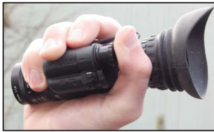
PNP-MCi small and unobtrusive