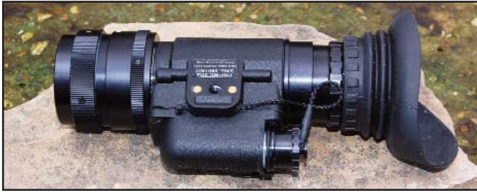
PNP-MCi 2x lens

The world's smallest, lightest most versatile C-mount night vision monocular system