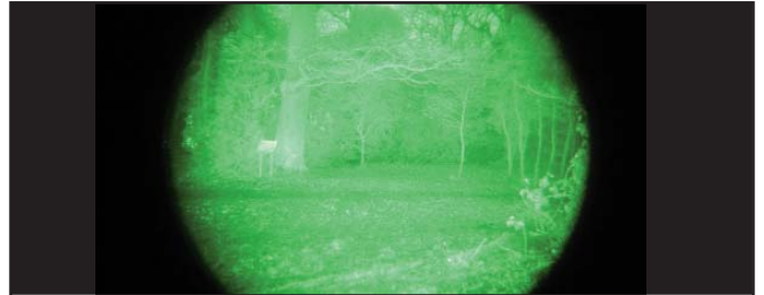
Picture using Optical Module and DSLR