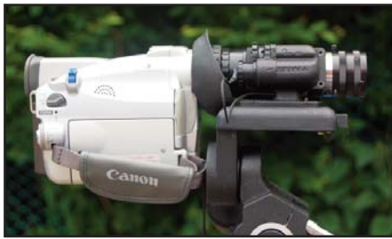
PNP-MCi with Camcorder