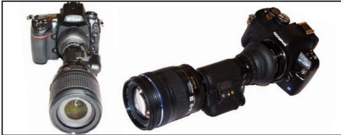
PNP-MCi using Optical Module attached directly to camera body