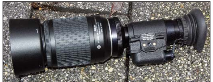
PNP-MCi using telephoto DSLR camera lens