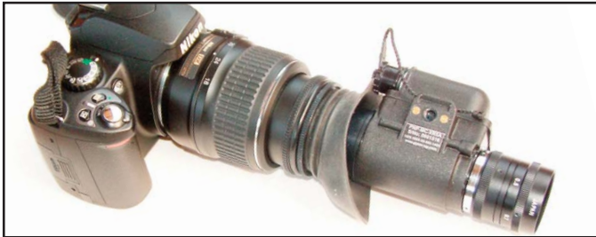
PNP-MCi attached to DSLR lens