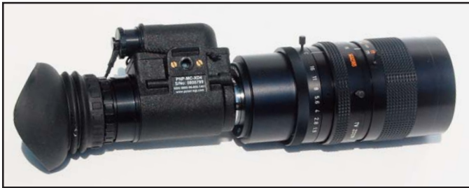
PNP-MCi 6x Zoom lens