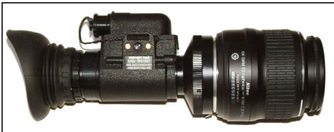
PNP-MCi using DSLR camera lens