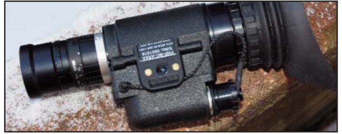
PNP-MCi 3x lens