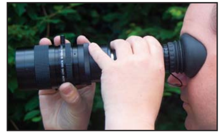
PNP-MCi long range Zoom 6x

PNP-i is a powerful, multi-purpose pocket-sized monocular night scope. The pocket scope is designed to be used either as a stand-alone night vision device or in combination with a wide variety of standard video, still-photo, CCTV equipment and spotting scopes.