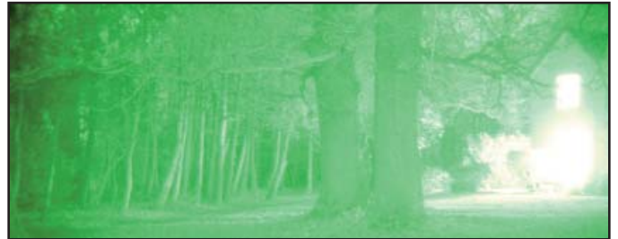
Picture using DSLR, camera lens zoomed to fill frame