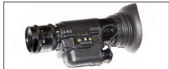
PNP-MCi standard configuration with 1x lens

For added security a red LED inside the 27mm eye relief eyepiece illuminates when the IR diode is switched on and a yellow LED in the eyepiece warns against a low battery charge situation.